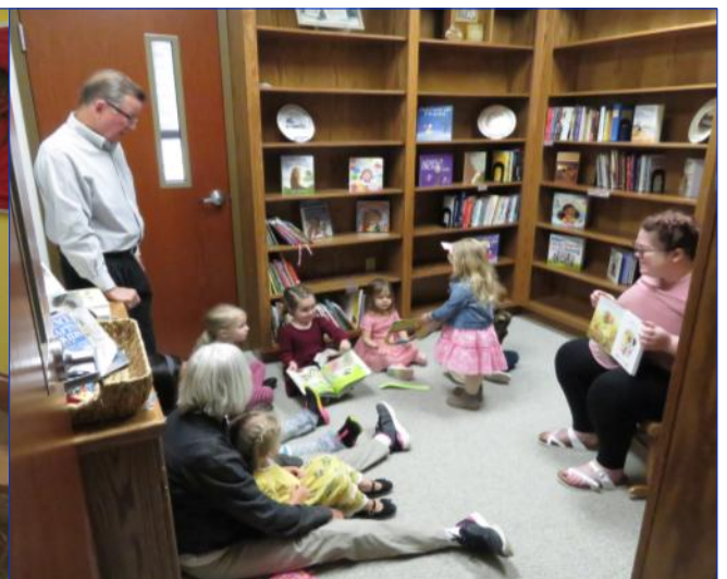
With 14 kids in JAM Session on Palm Sunday, they were split into two rooms! (Normally JAM Session has 7 kids in attendance.)