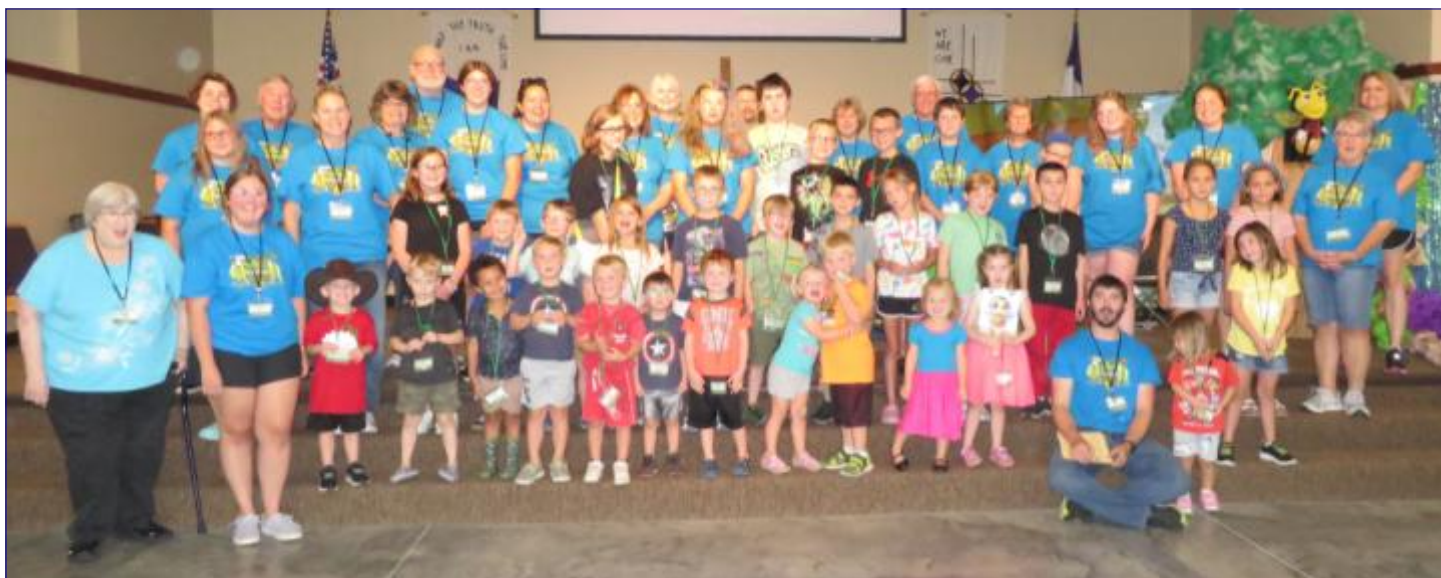
Above is the 2024 VBS Group photo. Below is the silly version.