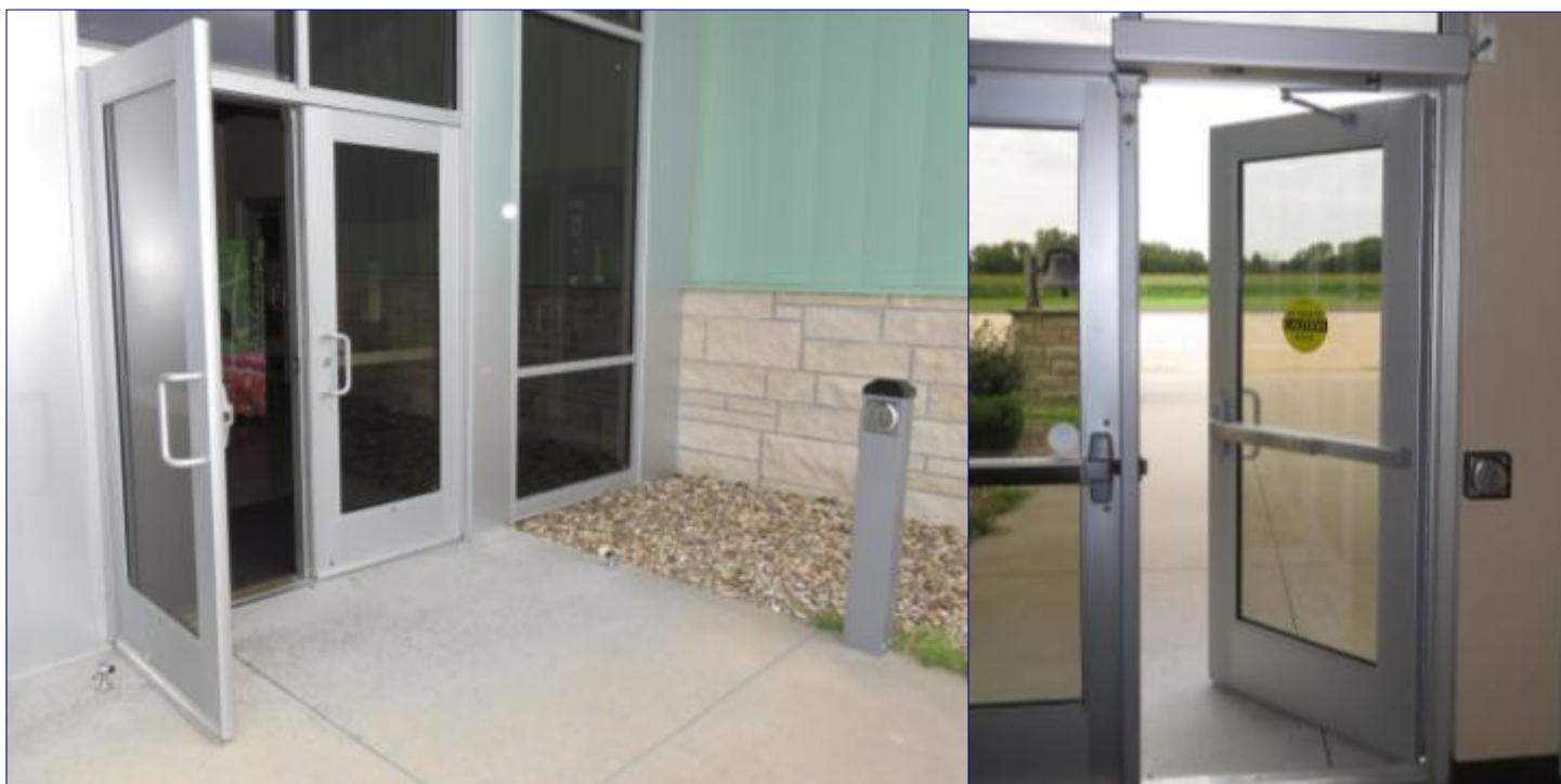
A new automatic door mechanism was installed mid-month on a front door. This was made possible through the RE and Roberta Henley Memorials.

Lots of kids love taking silly pictures. Here are the silly versions of the VBS small group photos on the cover.