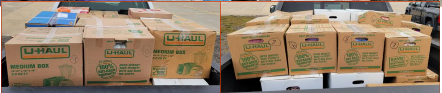
Top right, Debbie at blessing of the blankets 9/22. Middle, most of the people who helped pack the blankets to deliver. Bottom, two trucks full of blankets ready to be delivered.