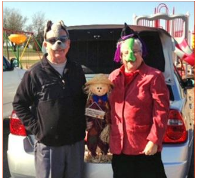
Some Trunk or Treat pictures from 2011-2014