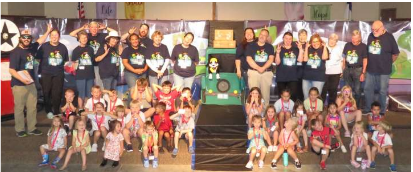
Our VBS folks sure know how to be silly!!