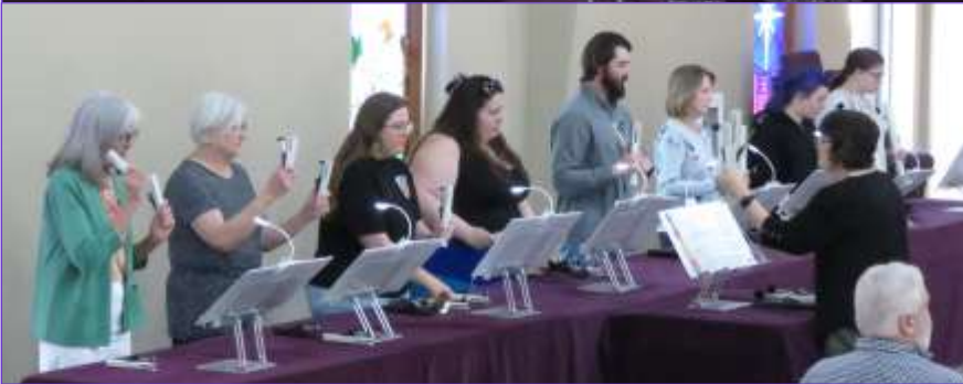
The Bell Choir played "O How I Love Jesus" on bells for prelude on March 15, above, and "Were You There" on the melody chimes for offertory on March 29, at left.