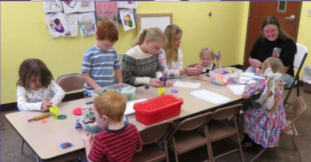
There they can play with playdough or blocks and then color as they listen to the day's lesson.