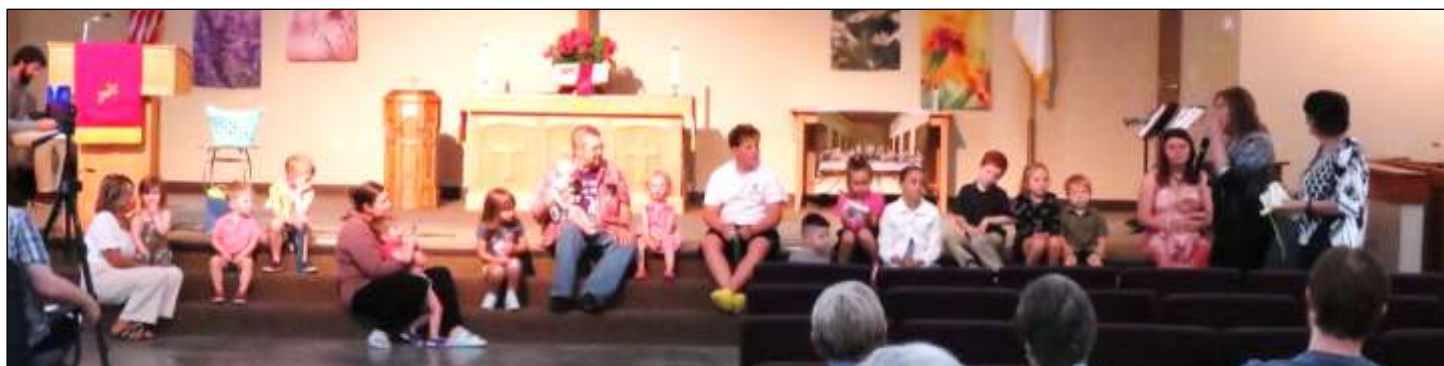
Children's Time on May 31 was incredibly full!