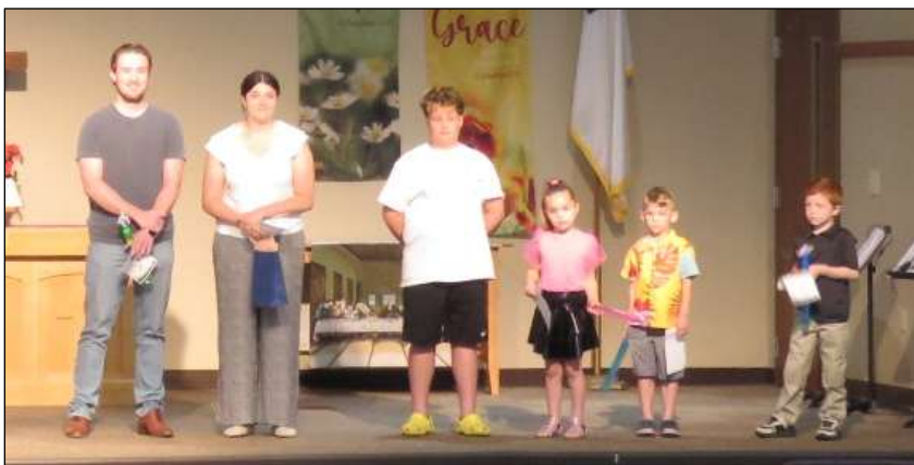
Of the 12 grads/promotees honored, six were able to attend. We were glad to have them!