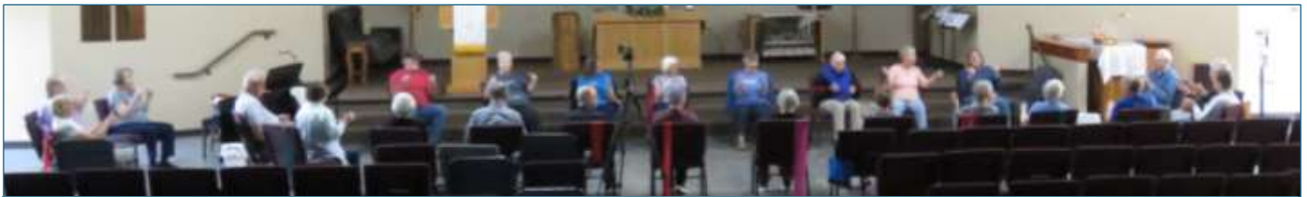
The exercise class has grown! On May 11 they had 24 in attendance!