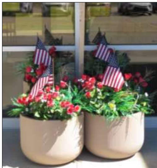
On Memorial Sunday we displayed flags in the front flowerpots and on the tables.

Adult Sunday School is offered every Sunday at 9 a.m. in room 201 (SW corner of the sanctuary.)