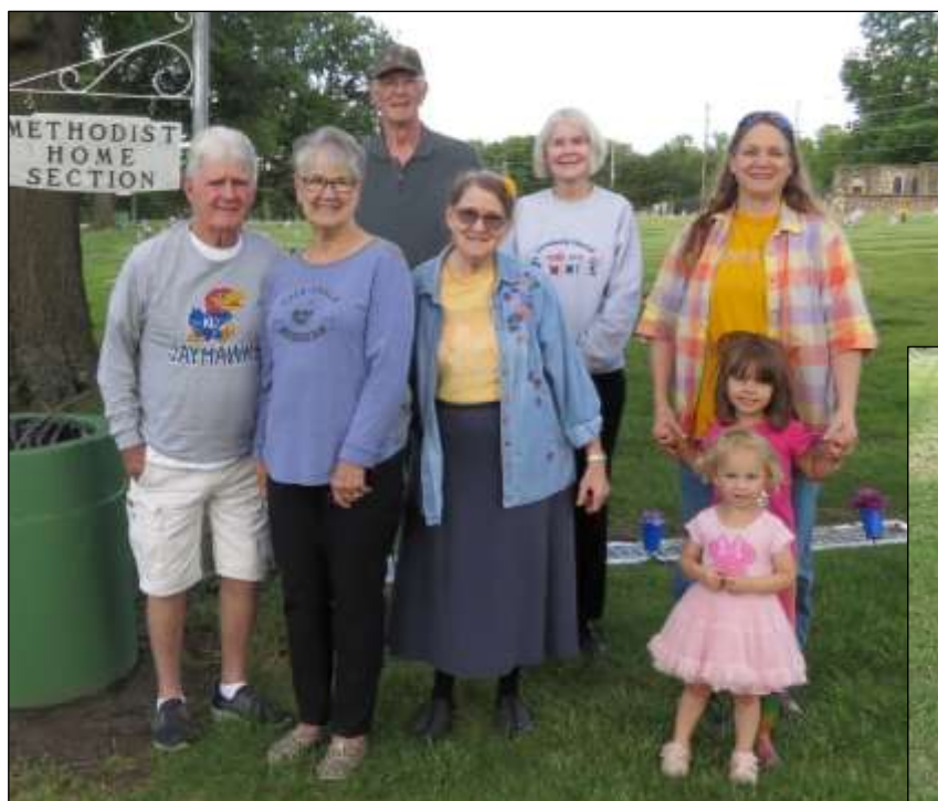
A good time was had by those who helped decorate the Methodist Home section of Mount Hope on May 22 – and the section, below, looked nice when they were done!