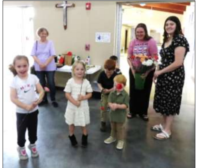
On Mother's Day, the JAM crew passed out carnations to all the women in the congregation.