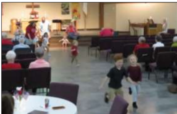
Kids leaving from Children's Time race to JAM!